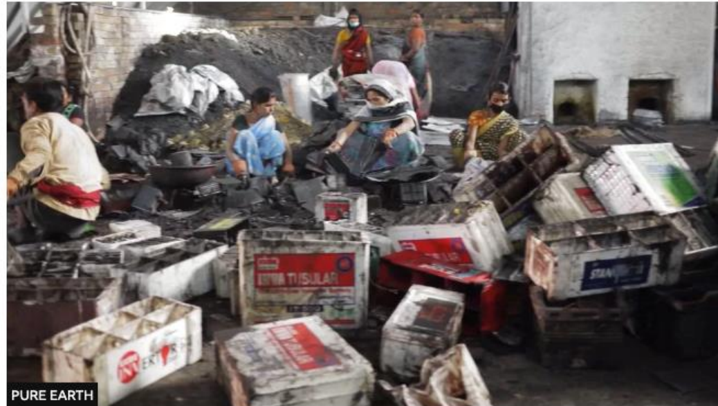
Unregulated recycling of lead-acid batteries is the main cause of lead poisoning